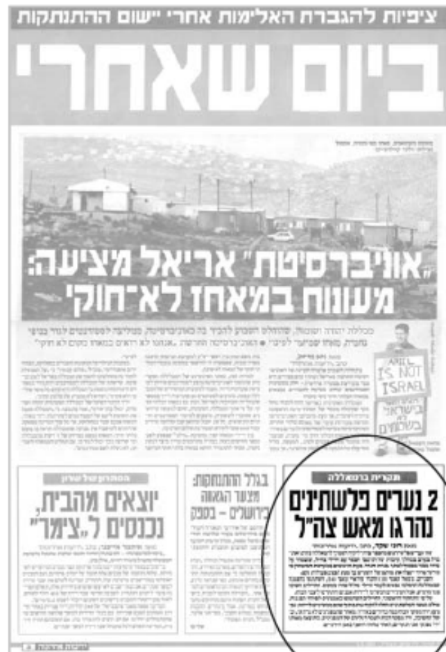
Yedioth Ahronoth, May 5, 2005, p. 3. Minor report on the killing of Palestinian youths by IDF fire. The coverage ignores questions that need to be asked.