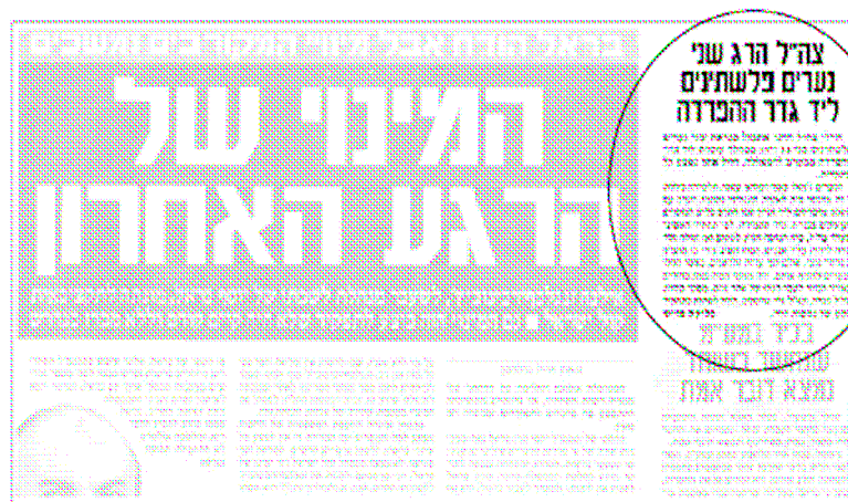
Ma'ariv, May 5, 2005, p. 14. Minor report on the killing of Palestinian youths by IDF fire.

With one exception, these reports were minimal and were downplayed through various editing techniques. The reports did not reach the front pages of the newspapers or the opening headlines of the television news broadcasts. Take, for example, the case of two Palestinian youths in Beit Laqiya who were killed by IDF soldiers' fire in a demonstration against the separation barrier, on May 4: The reports of their deaths appeared in a tiny item on page 14 in Ma'ariv , 6 in a small item on page 2 in Ha'aretz , 7 and in a small item on page 3 in Yedioth Ahronoth . 8 The television news editions all pushed the story to the middle of their broadcasts: The 11 th minute on "News 10", the 14 th minute on "News 2" and the 17 th minute on Channel 1's "Mabat". The next day, the media outlets reported on the dismissal of an officer who was involved in the incident, once again in the back pages of the newspapers and in the middle of the news broadcasts. The media outlets reported in similar fashion on the death of an activist in the Al Aqsa Martyr's Brigades on April 14, and on the death of an Islamic Jihad activist on May 2. On the same day, another Palestinian was shot by IDF soldiers. He was wounded and was arrested and died of his injuries three days later in a prison hospital. None of the media outlets reported it. 9