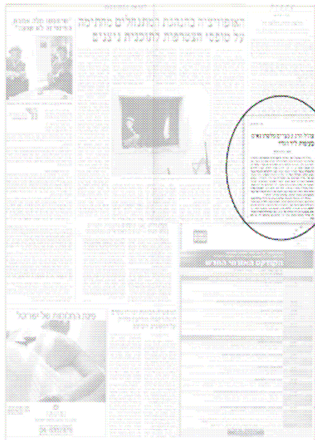
Ha'aretz, May 5, 2005, p. 2. Minor report on the killing of Palestinian youths by IDF fire.