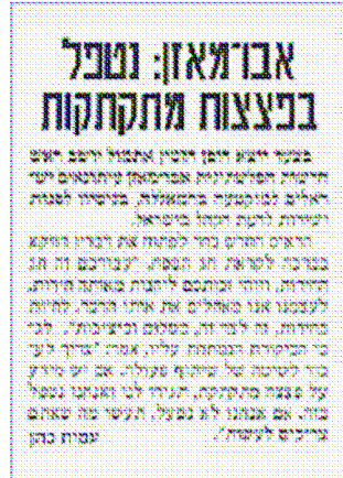
The item enlarged.

A tiny item on the interview that Abu Mazen granted to the Israeli media. There is no mention of Abu Mazen's criticism of Israeli policy. The headline reads: "Abu Mazen: We Will Take Care of Ticking Bombs".