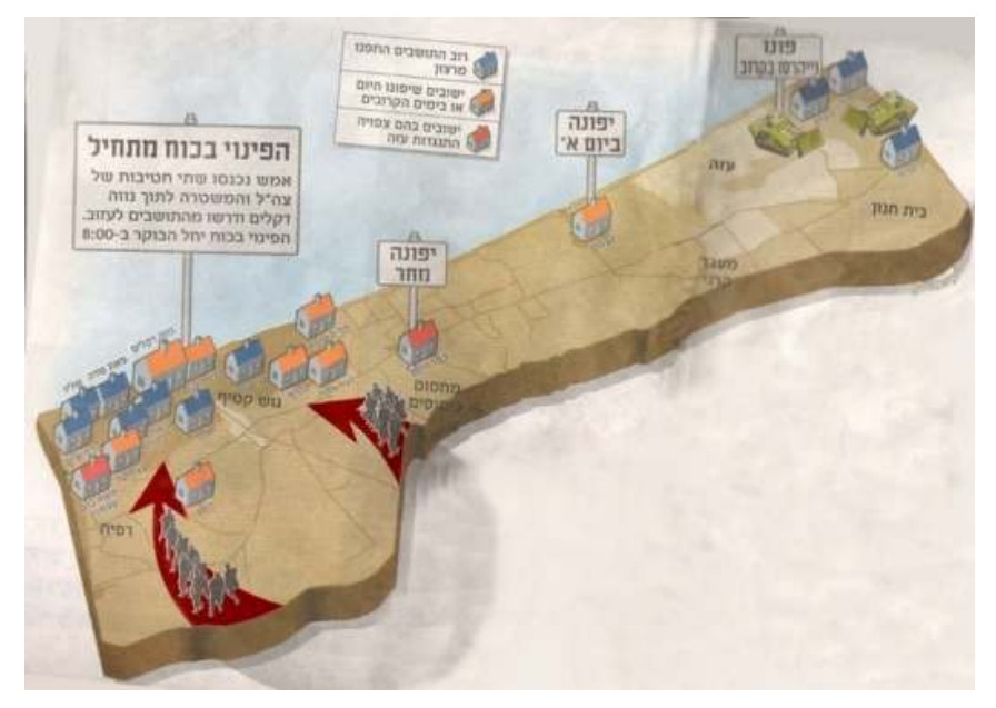
Ma'ariv, August 17, 2005, on pages 2-3. this map was also printed on the same issue's front page.

The story of the disengagement, then, was told by the Israeli media as an internal Israeli tragedy. The Palestinians were absent in all the ways we have seen, but also in the more immediate coverage of events on the ground throughout the disengagement. The following map, published on Ma'ariv 's front page on August 17<sup>th</sup>, aptly illustrates this situation:<sup>4</sup>