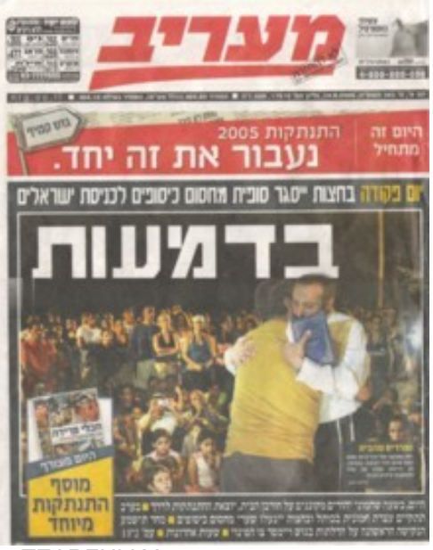
TEARFULLY Ma'ariv, August 14, 2005, front page.