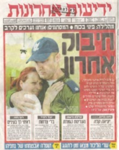
FINAL EMBRACE Yediot Ahronot, August 16, 2005, front page.

The newscasts and news-pages were filled with huge, heart-breaking pictures of tearful female soldiers hugging female settlers, policemen and evacuees praying and crying together, fathers avoiding their children's eyes. These tearful images appeared everywhere, including Ha'aretz , which is not known as an especially emotional newspaper. The newspaper printed such pictures on August 10<sup>th</sup>, 14<sup>th</sup>, 16<sup>th</sup>, 18<sup>th</sup> and 21<sup>st</sup>, and later as well. In Yediot Ahronot's August 16<sup>th</sup> issue, the main headline read FINAL EMBRACE, and was printed above a giant photo of a tearful female settler hugged by an IDF officer visibly restraining his anguish. On August 18<sup>th</sup>, under the main headline FAREWELL GAZA, the newspaper printed a huge photo of a sobbing settler about to faint. In her arms she holds her dazed infant daughter, on her right she is supported by a tearful female officer, and on her left a compassionate female soldier is patting the baby. Ma'ariv's main headline on August 14<sup>th</sup> proclaimed: TEARFULLY. Next to the headline was a photo of the farewell ceremony at Elei Sinai, and at its center, the community Rabbi hugging and consoling one of the residents. On August 18<sup>th</sup>, under the dramatic headline GUSH KATIF HAS FALLEN, we find a huge close-up of a young settler, sitting on the evacuating bus and sobbing.