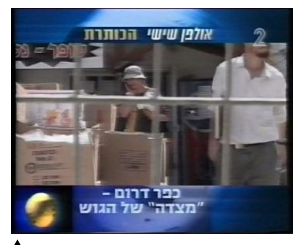
KFAR DAROM – GUSH KATIF'S "MASSADA", Channel 2, News headlines, August 12, 2005.

24 HOURS TO EVACUATION OF SA-NUR AND HOMESH: THE CONFRONTATION HAS BEGUN; ON THE VERGE OF EXPLOSION , Yediot Ahronot, August 22, 2005, front page, main headline.