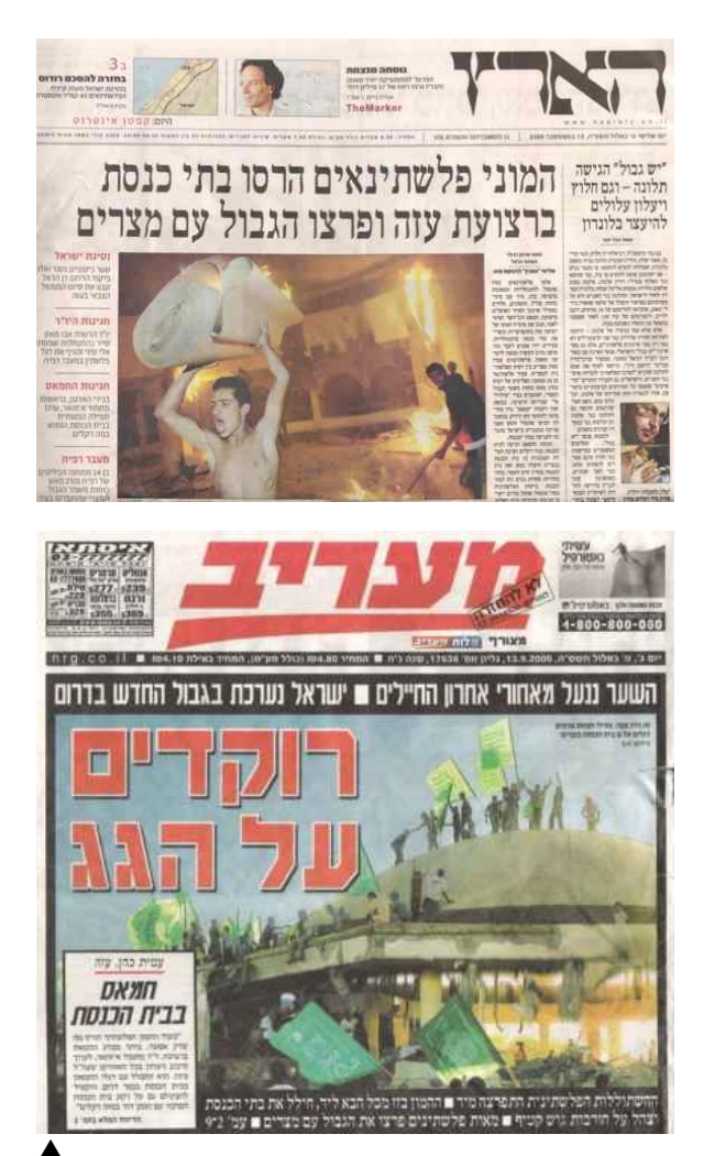
DANCING ON THE ROOFTOP Ma'ariv, September 13, 2005, front page.

MASSES OF PALESTINIANS WRECKED SYNAGOGUES IN THE GAZA STRIP AND ILLEGALLY CROSSED THE BORDER TO EGYPT ( Ha'aretz , September 13<sup>th</sup>, main headline on front page).