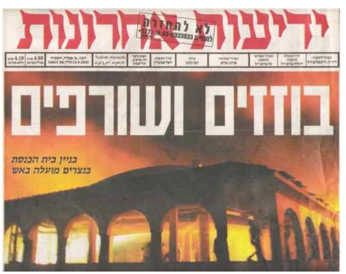
LOOTING AND BURNING Yediot Ahronot, September 13, 2005, front page.

MASSES OF PALESTINIANS WRECKED SYNAGOGUES IN THE GAZA STRIP AND ILLEGALLY CROSSED THE BORDER TO EGYPT Ha'aretz, September 13, 2005, front page.